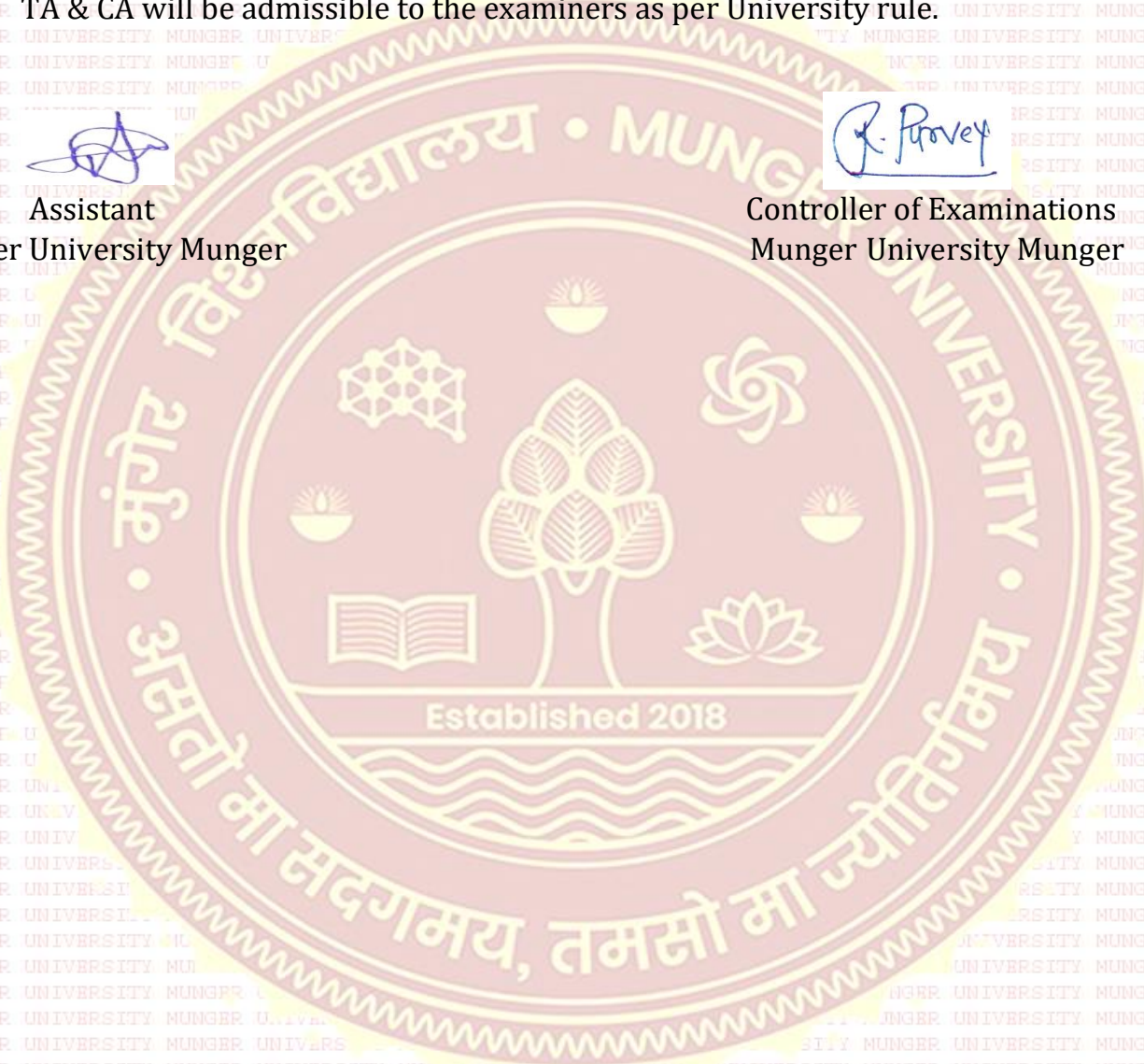
Controller of Examinations Munger University Munger